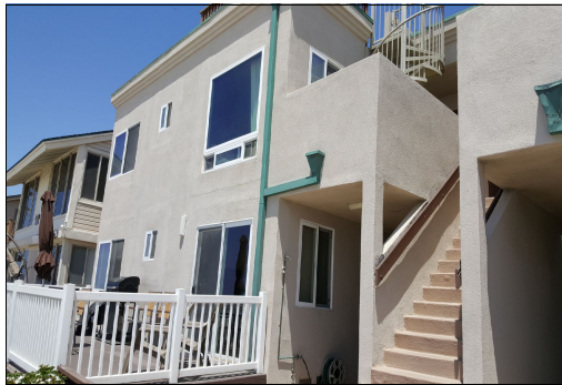
Home on San Diego Beach

The BSI conference, officially entitled "Fiesta de las Bromelias," ran from May 29 through June 3. The host city, San Diego, boasts $30-40,000 more in income per household than Miami-Dade County, so there's a lot more disposable income for residents to spend on such worthy projects as collecting bromeliads and creating stunning landscapes on sunbaked hillsides.