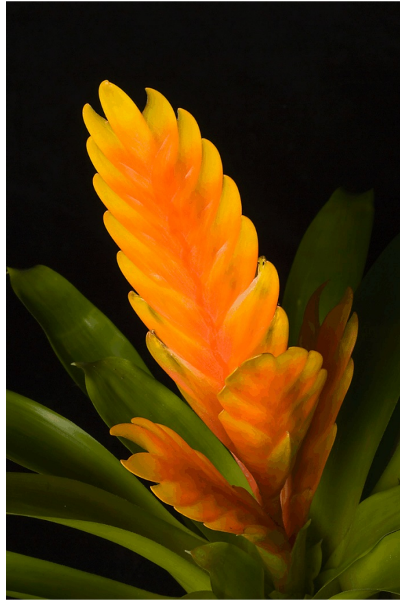
Nat DeLeon's magnificent Noemea Ruffles