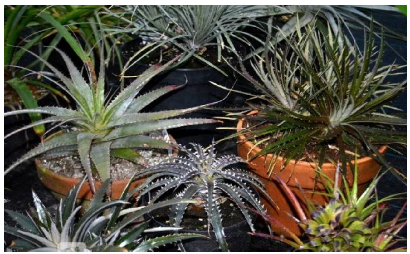
We are excited to bring back our Bromeliad Show & Tell this January, and this month's focus will be on Terrestrial Bromeliads . These fascinating plants grow in soil, much like other terrestrial species. If you have any specimens you'd like to share, or questions you'd like to ask our experts, please feel free to bring them in. We look forward to seeing your plants and learning from each other!