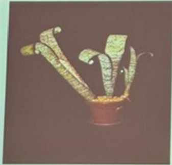
Plant Not Straight & Decorative Container Smaller than Plant Size