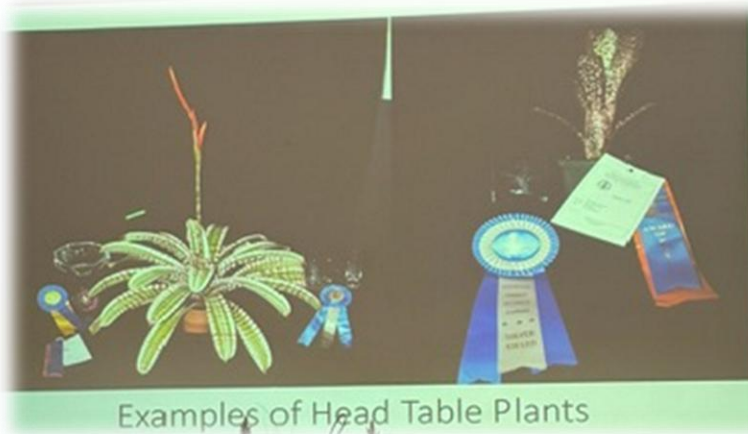
Examples of Head Table Plants

remove any spent blooms to enhance the plant's appearance.