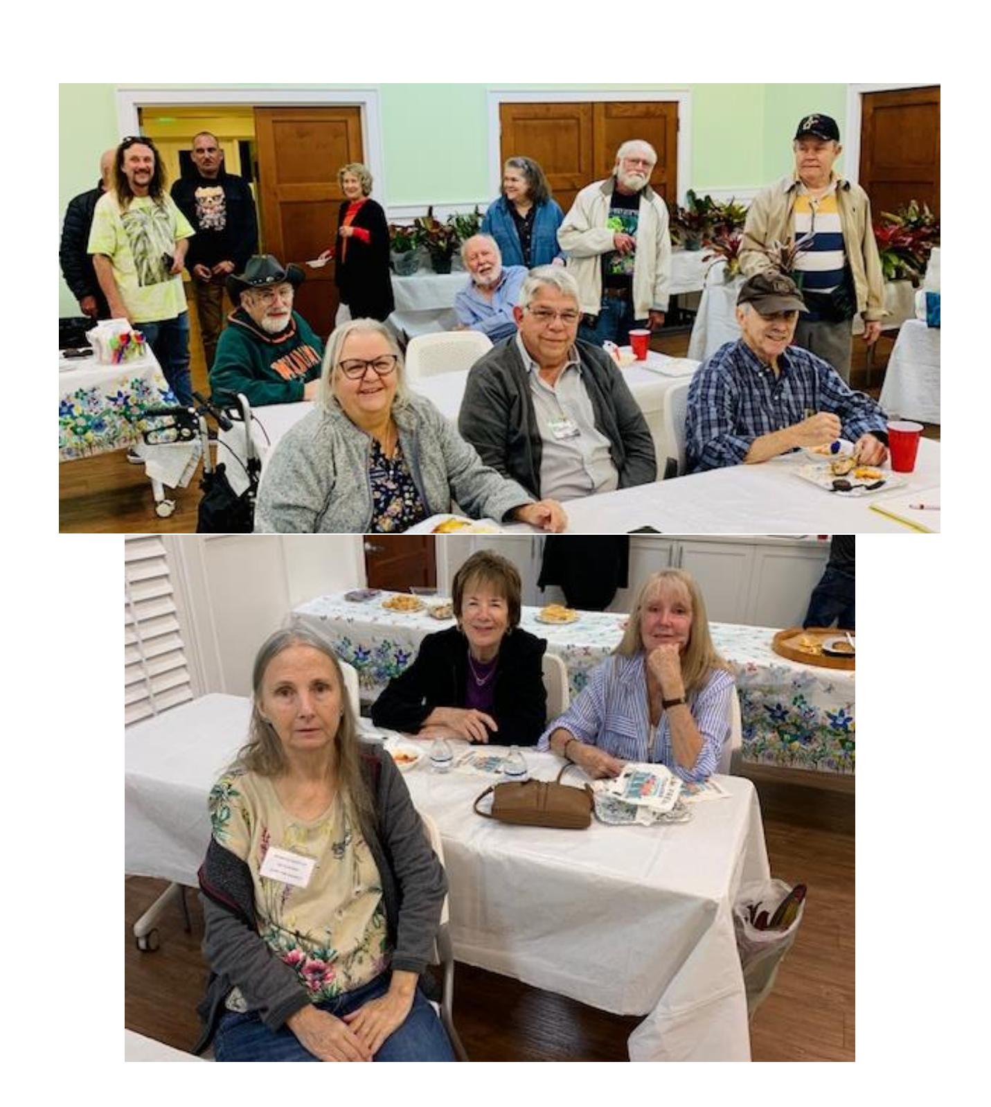
Thank you all for participating!